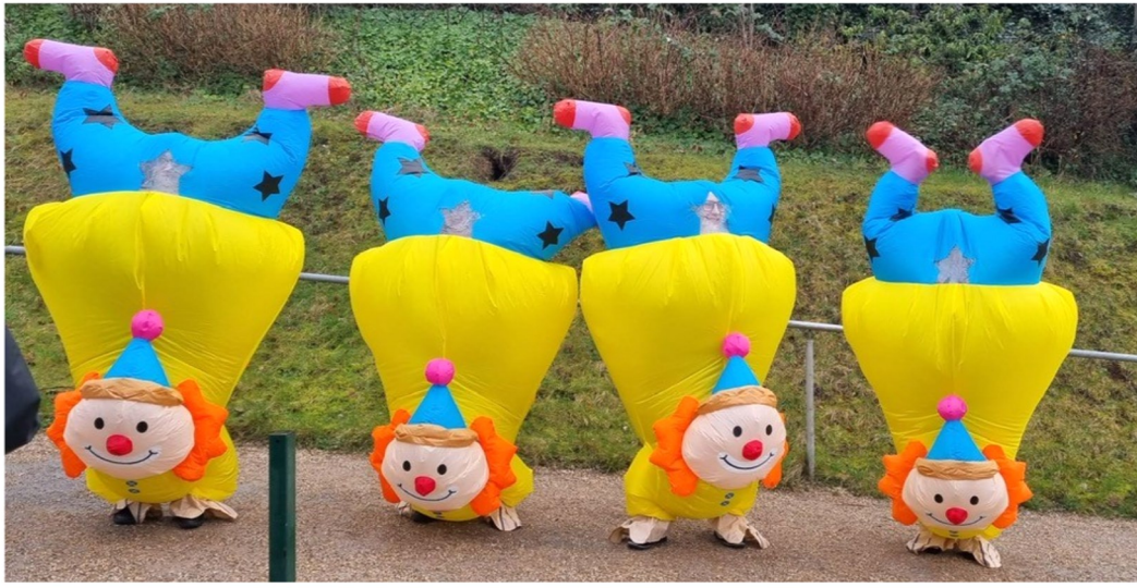
On Wednesday, the girls were greeted with music and clowns upon their arrival at school. After davening, they quickly got back to work.