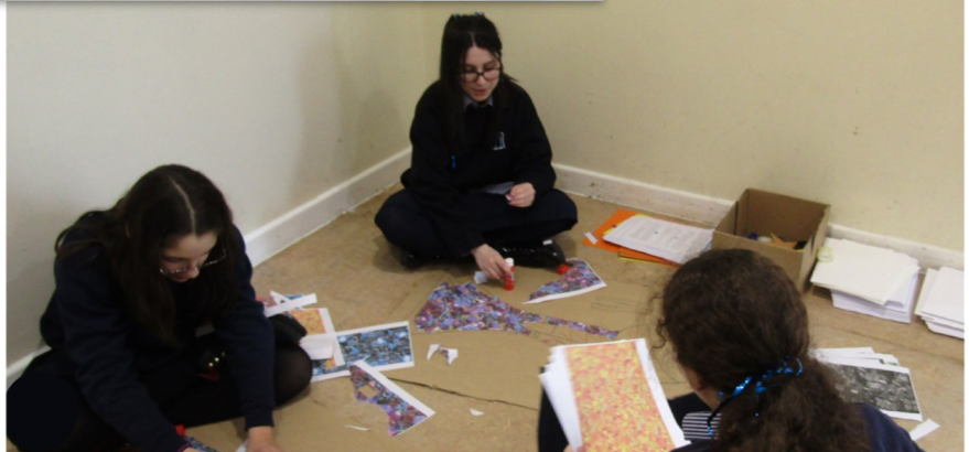
Year 11 showed outstanding leadership skills as they expertly organised and managed the rest of the school. They were all given iced coffees as a reward for their excellent behaviour and for shining as role models to the school.